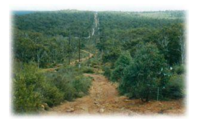
The 12.5km Powerlines section provides more difficult obstacles with a number of very rutted sections becoming flooded and causing all sorts of havoc to inexperienced drivers during the winter months.