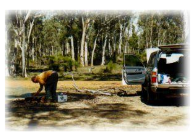
Picnic spots in the Wandoo Woodlands

Bushland, convict ruins, bush camps, St Ronans Well