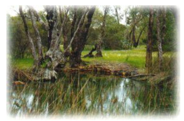
St Ronans Well - just west of York